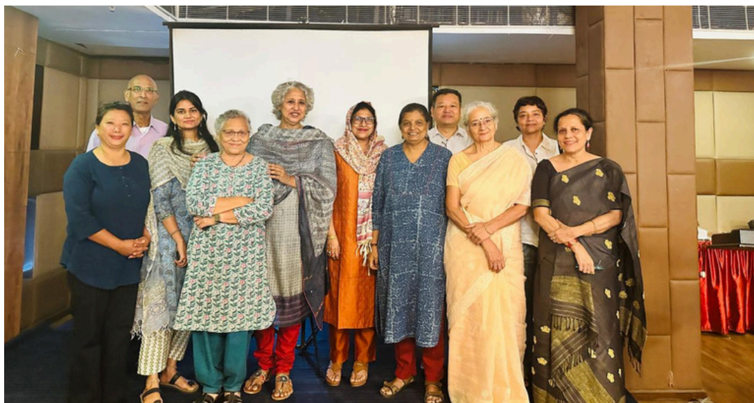
Glimpses from the Annual General Body Meet (AGM) 2025

NEN distributed bicycles to 17 girls and women across several districts of Assam, with support from AID India (Association for India's Development). The initiative aims to improve mobility and access to education and livelihoods.