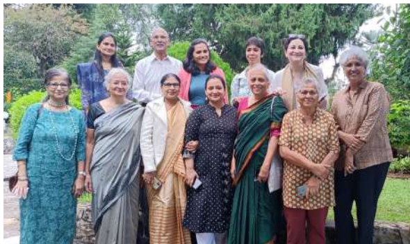
General Body Members at NEN AGM, held in Shillong on 28th September