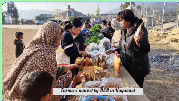
Farmers market by NEN in Nagaland

To assist women farmers of Nagaland establish and strengthen Community Seed Banks (CSB), NEN organised a 2 day Training on CSB at NEN resource center, VTC Hall, Chizami on 3rd & 4th February. This effort to strengthen women collectives was attended by 27 participants from 11 villages.