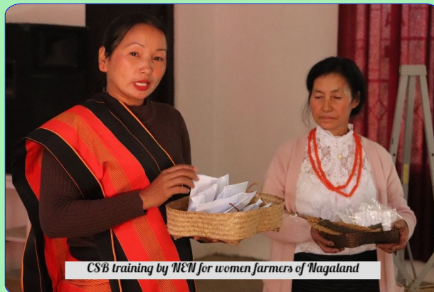
CSB training by NEN for women farmers of Nagaland