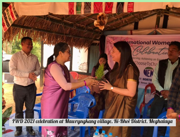
IWD 2021 celebration at Mawryngkang village, Ri-Bhoi District, Meghalaya

NEN in Nagaland, celebrated International Women's Day by bringing together rural women, village leaders and women collectives to celebrate women's leadership within their household and communities. The events highlighted women's agency and their capacity to bring about change in their own lives and communities, especially during the critical Covid-19 pandemic. IWD events were observed at three locations viz -Chizami, Meluri - Phek, Phekerkriema - Kohima and Shamator Town - Tuensang, simultaneously bringing together the community to a discourse and celebration of the success of grassroots women leaders and recognising their contribution to the welfare of the society.