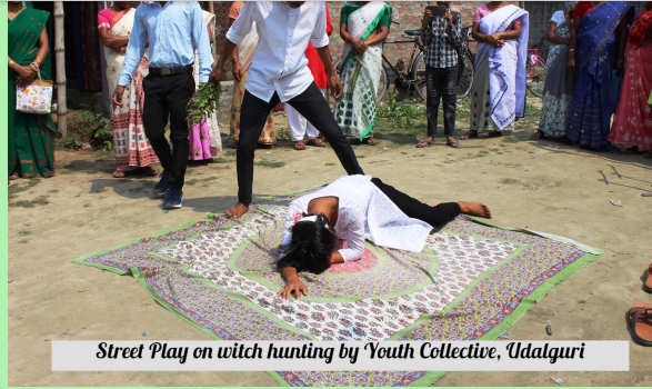
Street Play on witch hunting by Youth Collective, Udalguri

As a tribute to the tremendous contribution to the society and towards the development of their villages as well as the country, NEN in Meghalaya observed International Women's Day on 8th March at Mawryngkang village, Ri-Bhoi District.