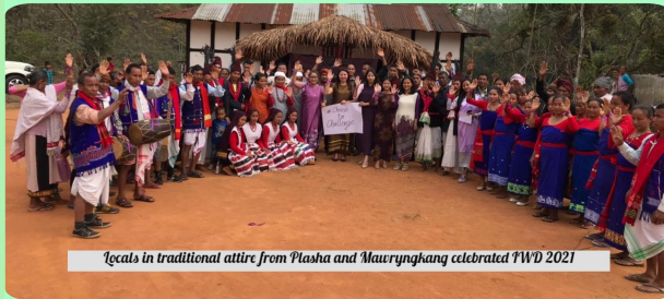
Locals in traditional attire from Plasha and Mawryngkang celebrated IWD 2021

As a tribute to the tremendous contribution to the society and towards the development of their villages as well as the country, NEN in Meghalaya observed International Women's Day on 8th March at Mawryngkang village, Ri-Bhoi District.