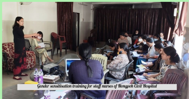
Gender sensitisation training for staff nurses of Nongpoh Civil Hospital

NEN, Meghalaya conducted the training for 17 staff nurses of Civil Hospital Nongpoh, Ri-Bhoi District on March 11, 2021. The aim was to cultivate understanding about the prominence of their role as health care providers, realising the immediate attention that is required in supplementing the health care workers with the required knowledge and skills to assist survivors of abuse.