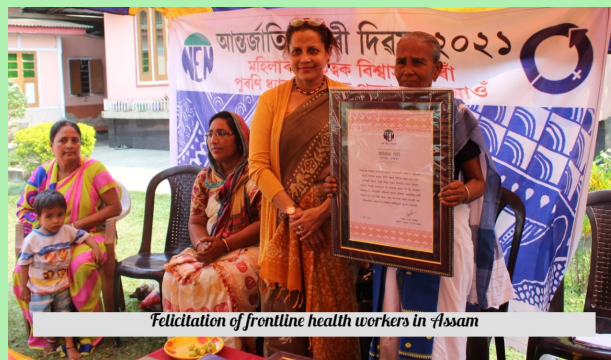
Felicitating of frontline health workers in Assam

This year, the theme for International Women's Day (8 March), 'Women in leadership: Achieving an equal future in a COVID-19 world' celebrated the tremendous efforts by women and girls around the world in shaping a more equal future and recovery from the COVID-19 pandemic and highlights the gaps that remain.